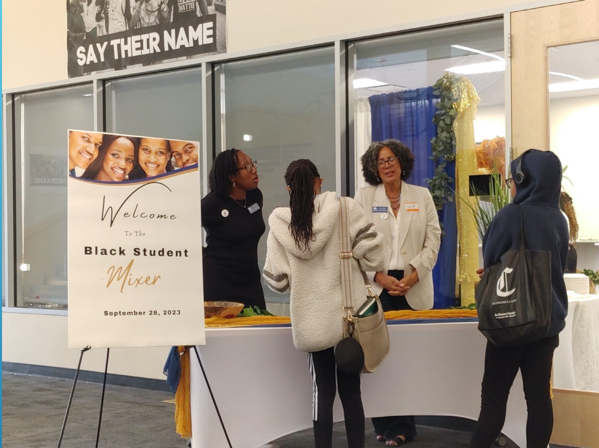
Black Student Mixer September 2023