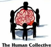
The Human Collective