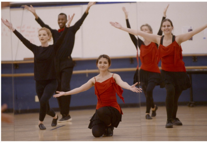
Solano Community College students rehearse a dance from the upcoming Elements Through Dance show, on Monday, April 29, 2019.