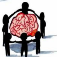
The Human Collective