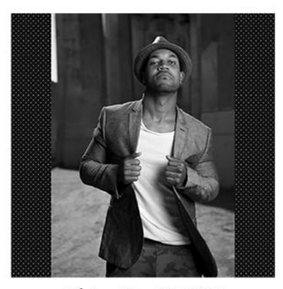
Friday, May 18, 2018 6:30 PM Reception 7:00-8:30 PM Presentation Solano Community College Vallejo Center, Multi-Purpose Room 545 Columbus Parkway, Vallejo, CA

Learn about his life growing up Deaf in a hearing, multicultural family, his career as a Black Deaf actor in Hollywood, and much more!