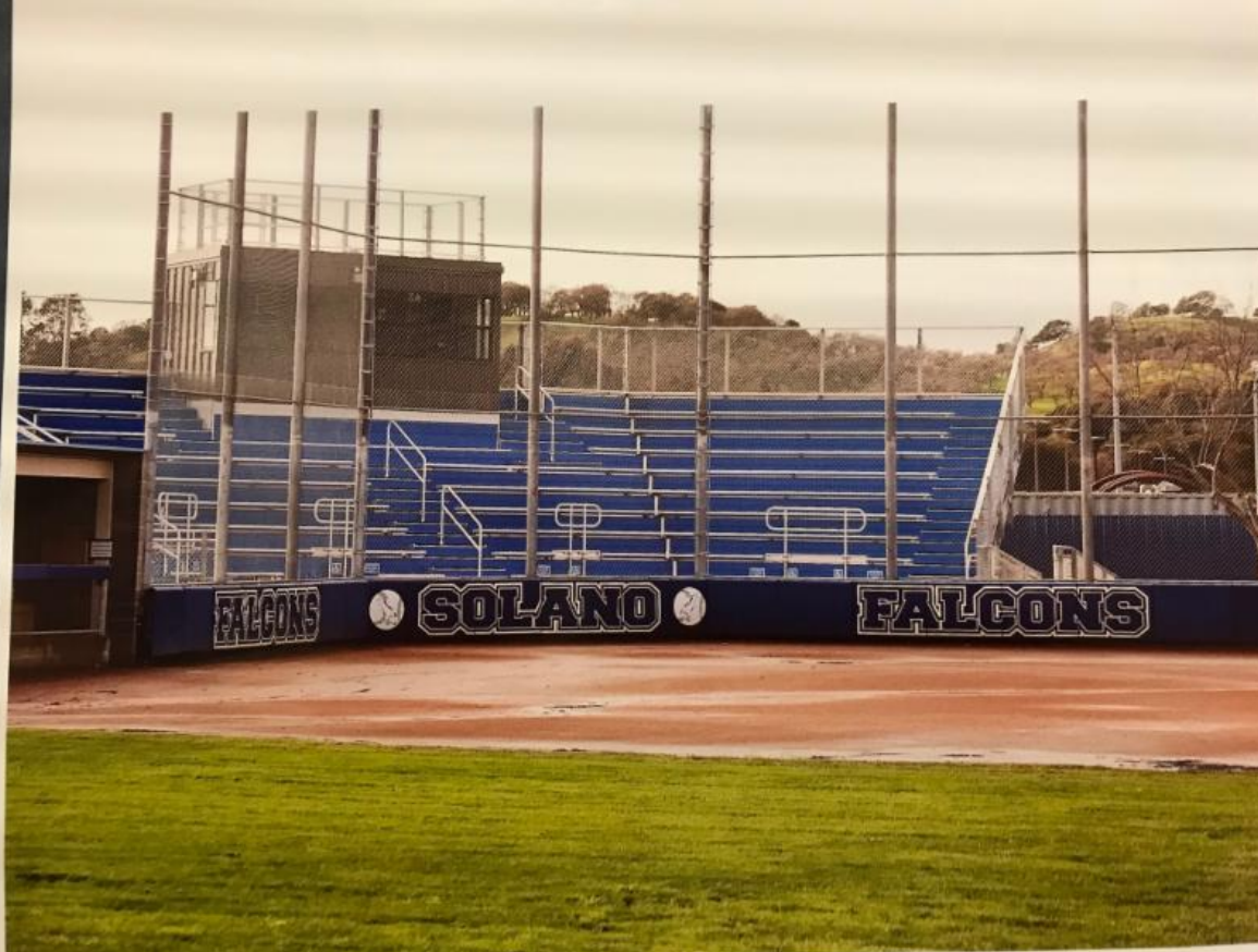
SCC's newly renovated softball stadium