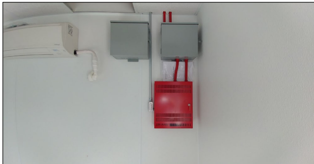
Completed Fire Alarm System Installation