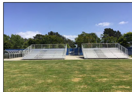
Existing Soccer Field Bleachers