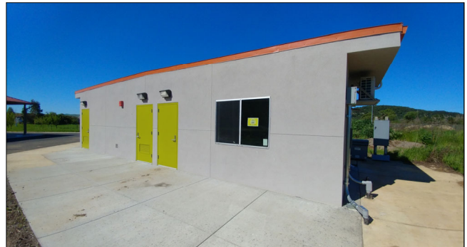
Modular Restroom Building and Surrounding Hardscape