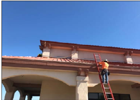
Decorative Wood Corbels to be Removed Due to Dryrot Issues