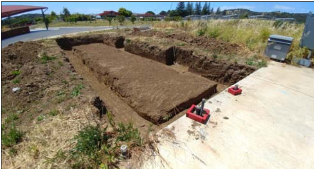
Completed Excavation for Building Foundation