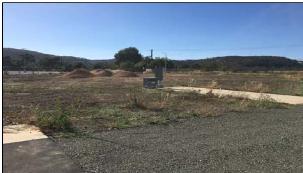
Future Site of Restroom Building