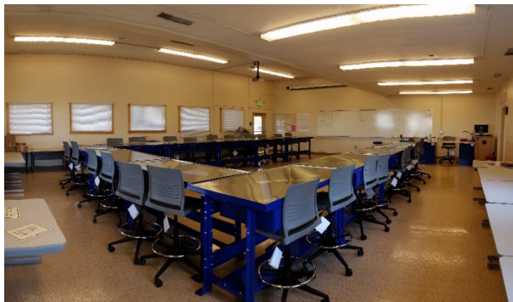
1301 Georgia Street Autotech Classroom

Autotechnology Building: Solano Community College re-established its automotive technician program in spring 2013 to complement existing auto body and hybrid/alternative fuel programs. Prior to its current swing space location in Vallejo, the program was housed at Armijo High School in Fairfield CA. The new Auto-technology Building will be located in Vallejo and it will house classrooms, faculty offices, specialized automotive classroom functional spaces that accommodate the automotive technologies being used within the classroom functions.