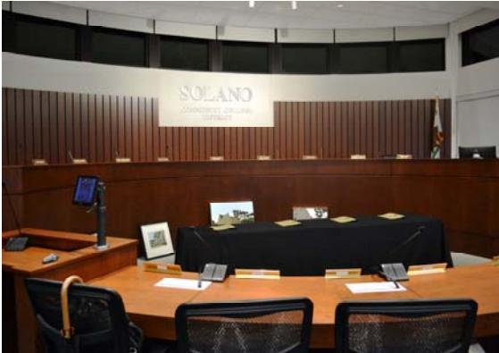
New Board Room

Building 600 (Administration Building) Renovation is the last major Measure G project. Construction of Building 600 commenced in May, 2014 and moved rapidly over summer for on schedule completion in December 2014. College celebrated the opening of the renovated administration building on December 17, 2014 as the final project in District's Measure G capital improvement bond.