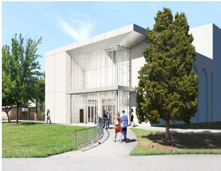
Design rendering of building exterior.

Performing Arts Building (Phase I, B1200 Renovation): As a state funded and approved project, Building 1200 Theater Renovation includes a complete renovation of existing 26,000 SF building to primarily address failing infrastructure facility problems and to bring the building up to current building code standards. Majority of the work will focus on upgrades or complete replacement of HVAC system, electrical, seismic, technology and ADA accessibility upgrades. Project architect team is LPAS. During 2013/2014 year, the team collaborated with the building users, Facilities and Information Technology teams in completion of programming and design documents. Project was submitted to DSA in November, 2014.