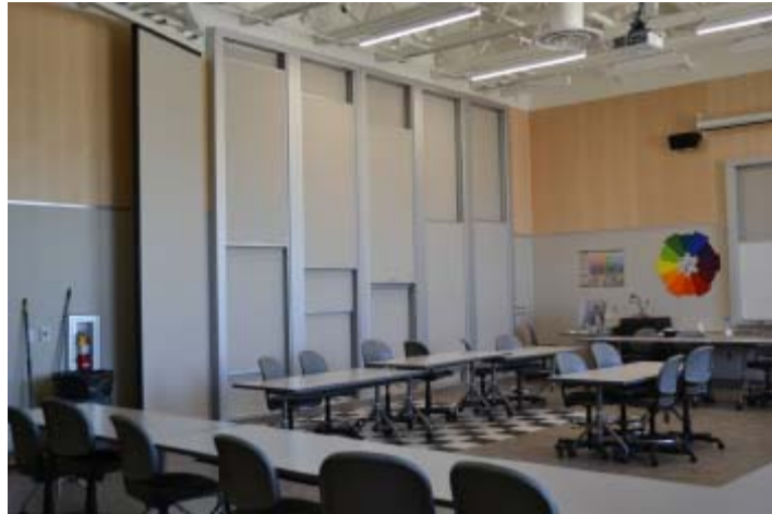
Building 1300 renovated classroom

Fine Arts Remodel – Building 1300: This project included a complete renovation of all existing spaces, expansion of the gallery and minor landscape and exterior upgrades. Project construction was completed in fall 2013 with furniture, fixtures and equipment phase complete in spring 2014. This project is DSA closed and certified. Project is in final financial close out phase.