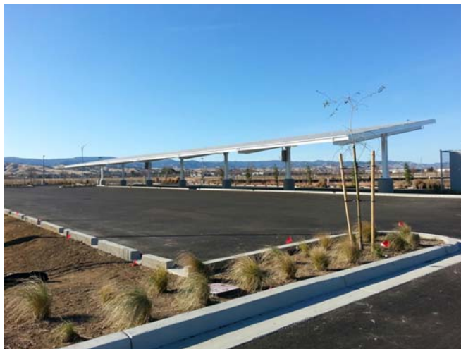
Completed parking lot area with solar panel row

Vacaville Center Parking Lot Expansion: This new parking lot opened in April, 2014. Project is now DSA closed and certified. Currently, this project is in financial close out.