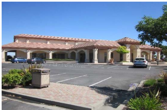
Vacaville Annex Building

Vacaville Classroom Building Purchase and Renovation: Building purchase was completed and Board approved in spring 2014. Procurement of project architect and structural engineer is well underway for execution in late 2014.