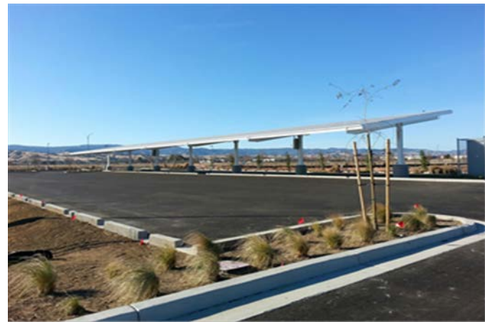
Vacaville Center new Parking Lot with Solar Panel