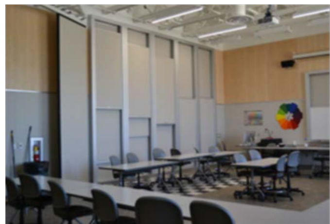
Fine Arts Building Classroom

This project consists of a complete renovation of the existing 12,300 square foot building that houses College's Fine Arts Department classrooms, offices and work spaces. The project also included an addition of a new gallery space. Project was completed in Fall 2013.