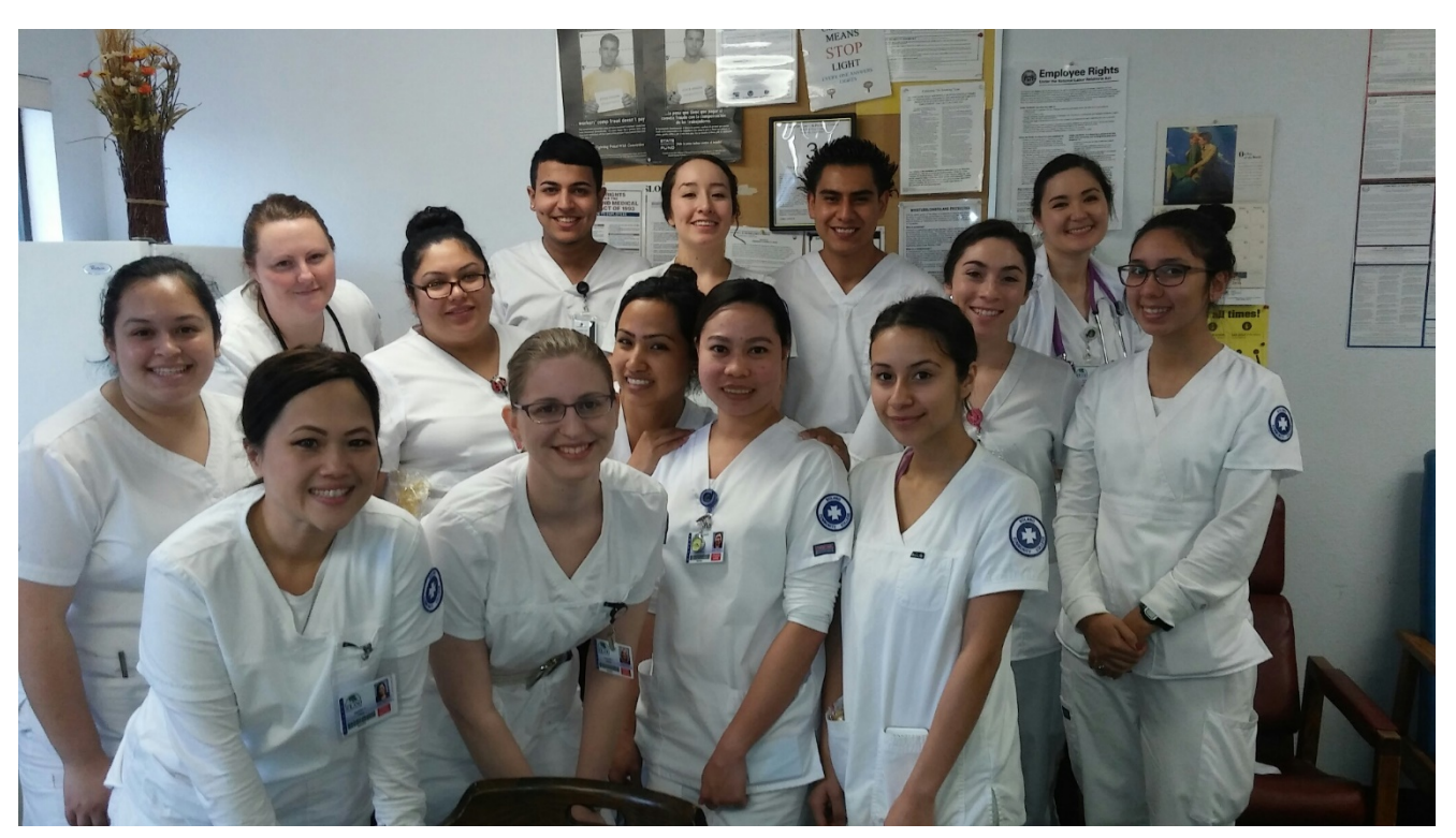
During the spring and fall semesters, the class meets during the first eight weeks .

Nursing 103 – BASIC CLASS this is the basic course for the professional Certified Nursing Assistant. The focus is on caring for the elderly with compassion. Students are taught principles of infection control, communication techniques, and the skills to safely care for people. These skills include bathing, dressing, assisting to eat, grooming, toileting, lifting and moving while using proper body mechanics.