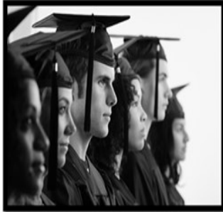
Sponsored by the SCC Transfer Center

Don't miss out on this special opportunity to have your transfer questions answered!