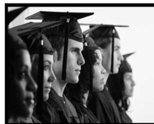
Sponsored by the SCC Transfer Center